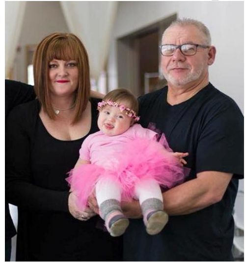
Baskets of Hope (find them on facebook)